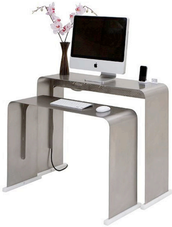
The desk and computer I use.